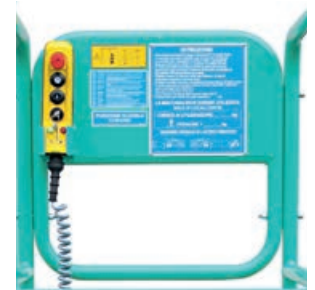
Removable control allows for easy and safe movement. Equipped with key switch and emergency stop button.