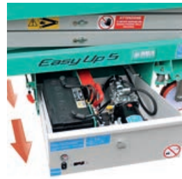
All the component parts are easily accessible for servicing.