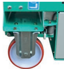
Auto braking on castors.