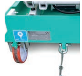
Winching eye for easy transport.